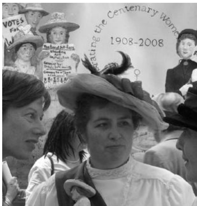
Above: the Honourable Candy Broad, Minister for Housing meets the suffragists at the Regional launch in Castlemaine